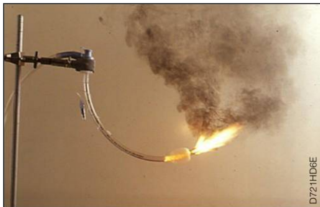
Figure 2. Demonstration of rocket-like flames shooting from a tracheal tube caused by laser ignition of the tube with 100% oxygen flowing.

The ignition of a standard tracheal tube from a piece of incandescent material, nearby flaming tissue, or laser beam in an oxygen-enriched atmosphere can produce a rocket-like fire, smoke, and hot gases from the tube, which is being infused with gas continuously (see Figure 2). The result can be extensive damage to a patient's air passage and lungs. 2 An orange or red glow from the tracheal tube or a darkening of the breathing circuit is an indication that the tube is on fire. 3 ECRI Institute estimates, based on published accounts and incidents reported to it, that approximately 21% of surgical fires occur in the airway. 4